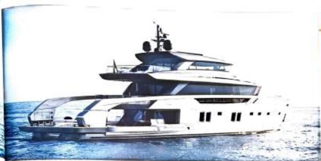
So right they almost completely disappear. They have the same look as the hull of a submarine, but they are not a submarine. They are a yacht. They are a yacht.

When designing the exteriors we developed a concept of synthesis. The tendency in yacht design is often to overload things, to be over the top, providing an overload of information. We've done the opposite by synthesising the extreme, creating the necessary elements and no more.