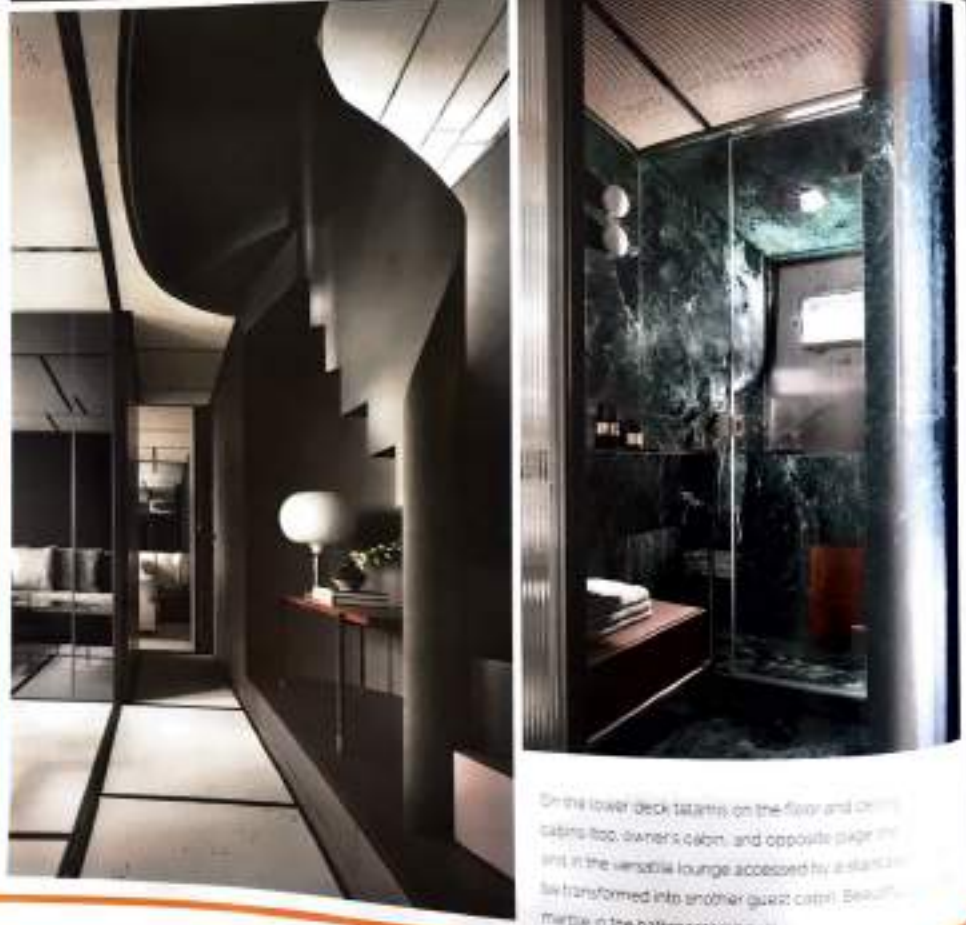
On the lower deck terraces, on the floor and ceiling, cabins (top, owner's cabin), and opposite (right) the stairs in the versatile lounge accessed by a staircase that can be transformed into another guest cabin. Beautifully detailed marble in the bathroom's wavy