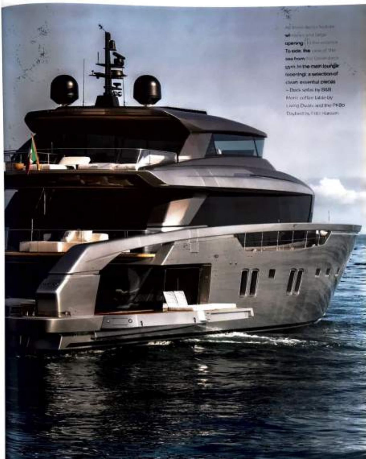
The yacht's design features a large opening in the volume To see the view of the sea from the lower deck gym. In the main lounge opening, a selection of clean essential pieces - Deck sofas by BBR Motor coffee table by Living Divani and the PK80 Daybed by F&B Habitat

R ethinking spaces, suggesting new styles of on-board life, enabling the sea's presence to pervade the interior. The SX112 has high ambitions, interpreted through the impact of clean, contemporary stylistic features and technological research.